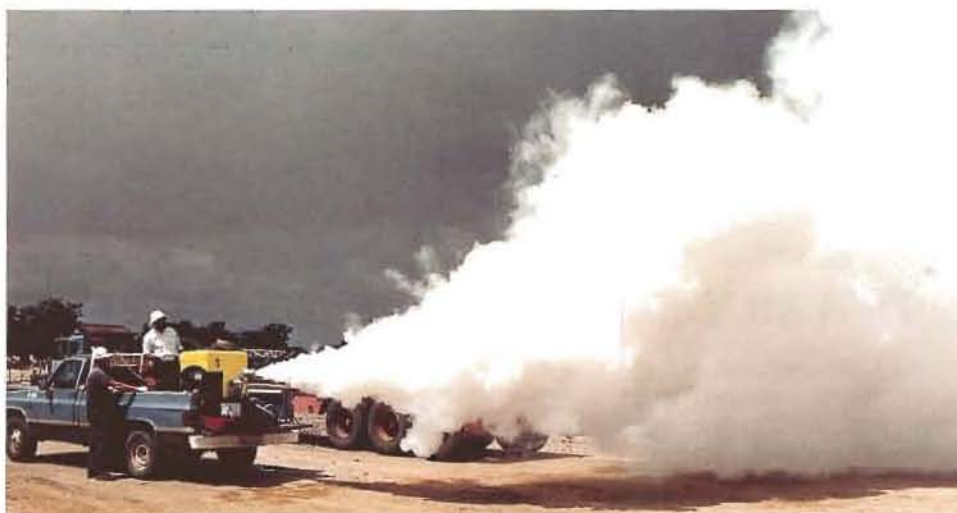
Thermal Fogging Technique 1 - 50 Microns Droplet Size