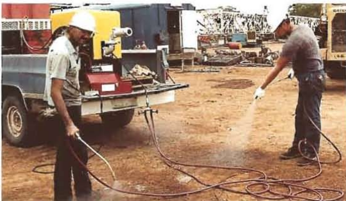
Larvaciding/Residual Spraying Technique 100 - 300 Microns Droplet Size

★★★★ FREE LIFETIME FIELD BACKUP SERVICE ★★★★★