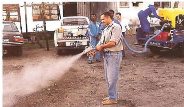
Conventional/High Volume Spraying Technique 100 - 500 Microns Droplet Size