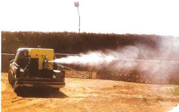
Cold Fogging/Aerosol Technique 20 - 200 Microns Droplet Size