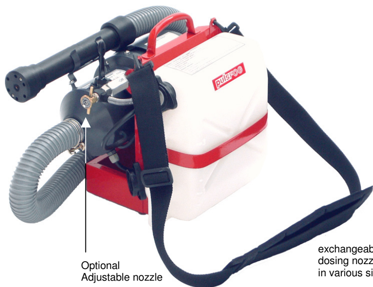
Optional Adjustable nozzle